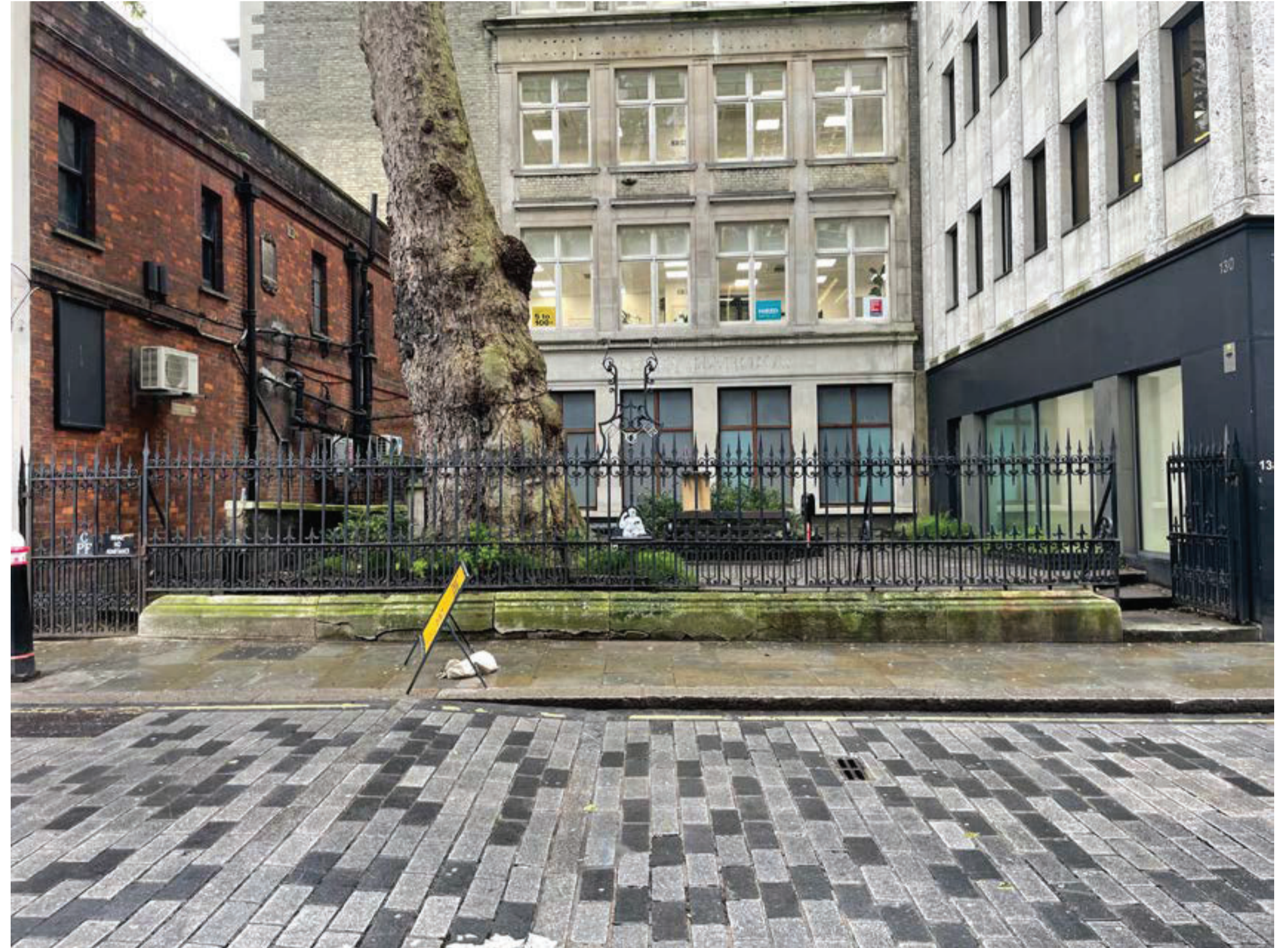
St. Peter's West Cheap, April 2024