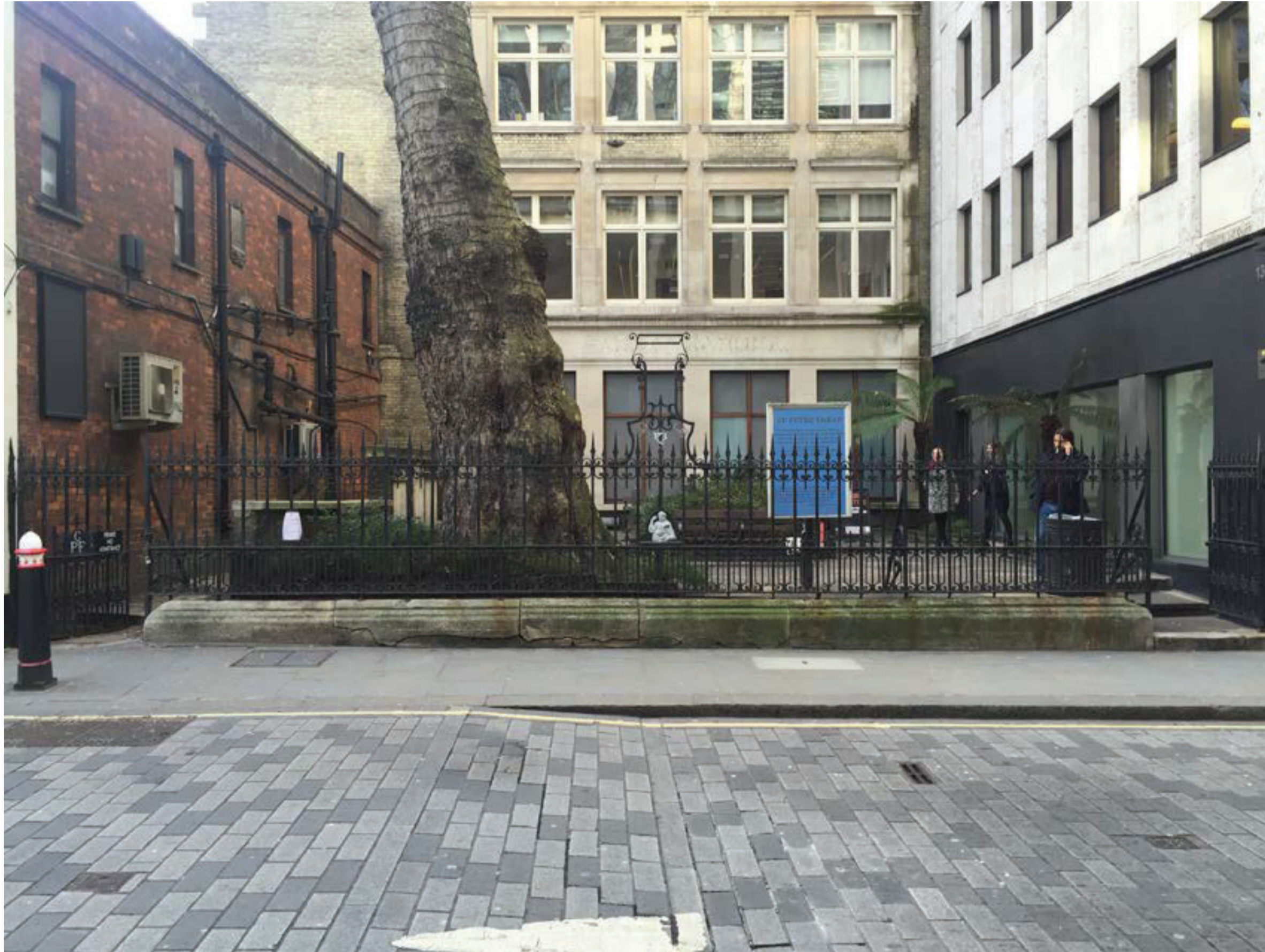
St. Peter's West Cheap, 2017